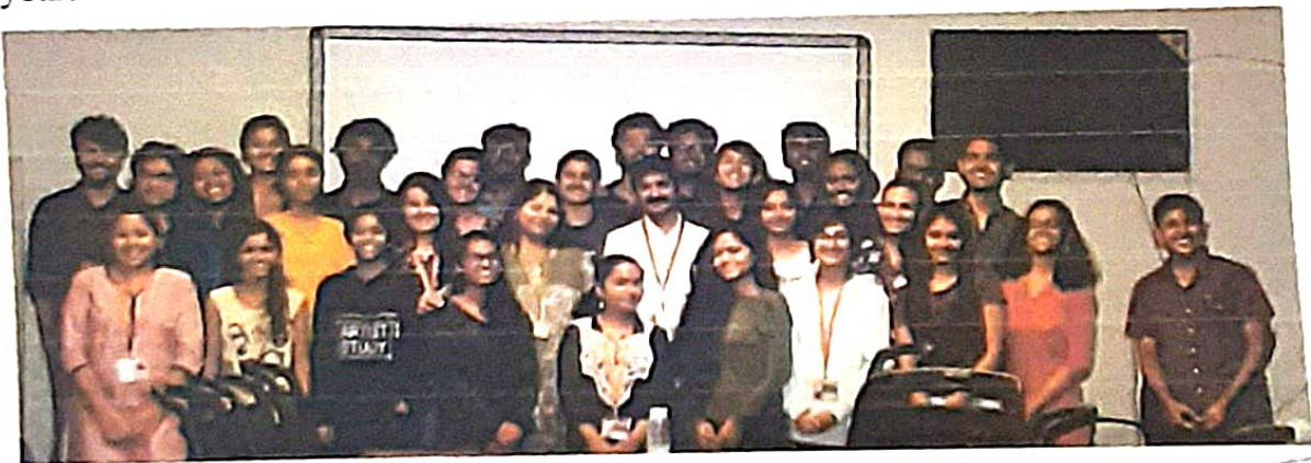
Team DFF 2018-2019

All of those team members with their consistent efforts made all the above activities of DFF successful and meaningful and set the agenda for new academic year.